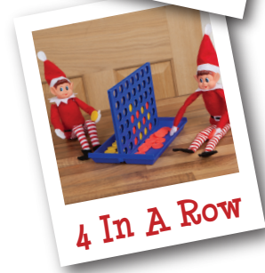
4 In A Row