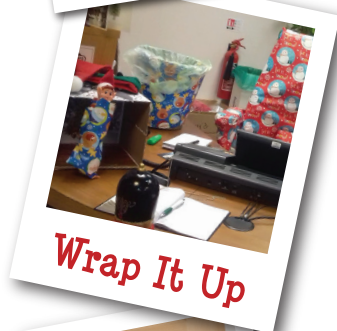
Wrap It Up